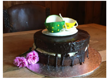
An amazing rum and coke cake by Carole Wensley-Dodd