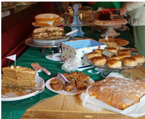
What a choice!