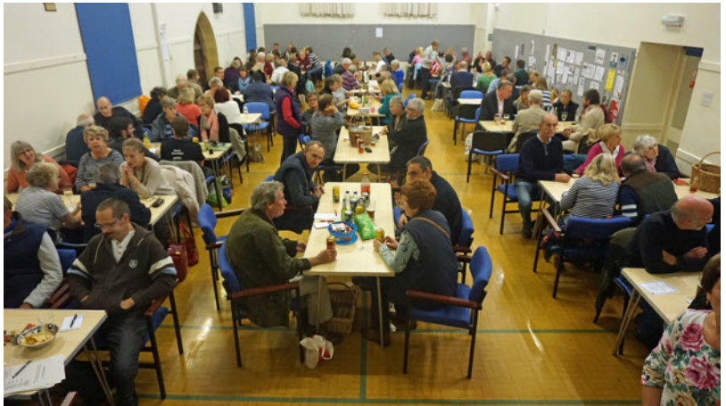
table in advance to avoid disappointment given that we can only have a maximum of 20 tables, each consisting of no more than six people.

On Friday 6 October it's the Neroche Hall Fish and Chip Quiz with Mike Michaels as our quizmaster. As before we will be asking you to book your